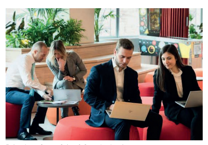
Relax Area, Genoa Cyber & Security Academy

Leonardo's Cyber & Security Academy employs dynamic space ergonomics that allow the creation of customised environments to promote information sharing and teamwork. All the Academy's physical spaces are also designed to support remote or hybrid training.