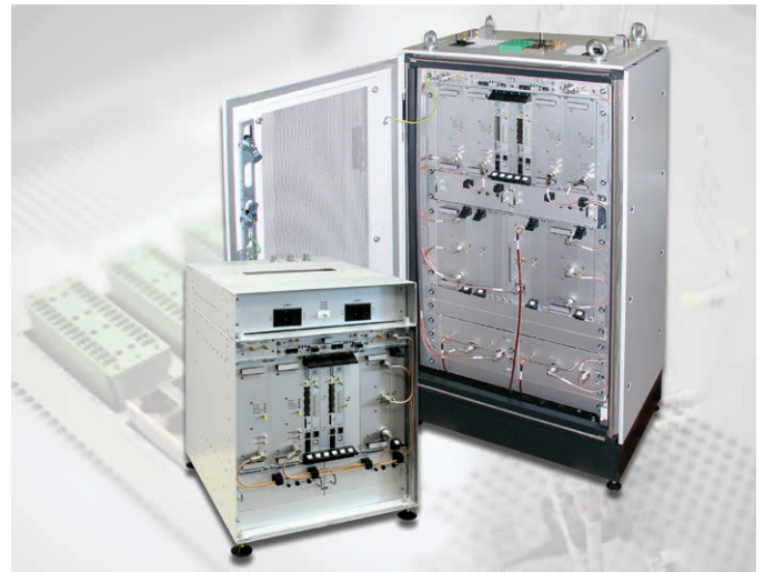
Radio base stations BS Node series for TETRA network coverage