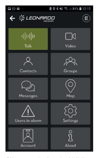
Client terminal typical MMI (main menu)

Message capability is provided in a chat style with the possibility to include documents and multimedia objects.