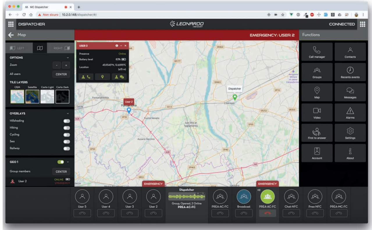
Dispatcher user interface