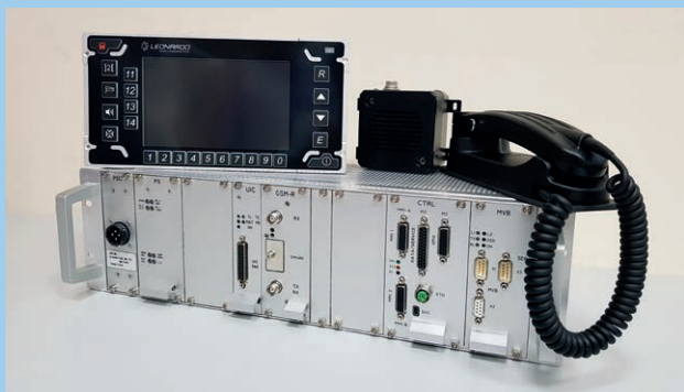
e-RaCE2 equipment configuration

An external duplexer unit (inside 3U shelf, 19") is optionally provided when the GSM-R antenna system is installed in close proximity, due to the lack of space on the roof of the locomotive. With this option GSM-R antennas can be positioned at a minimum of 1m distance from each other.